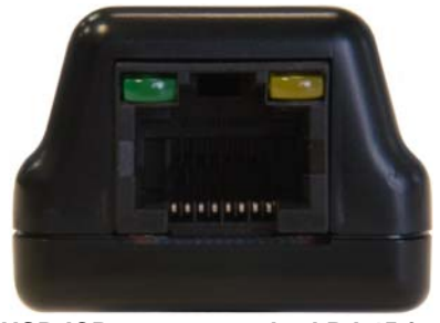
USB-ICP uses a standard RJ-45 for connection to the target cable.